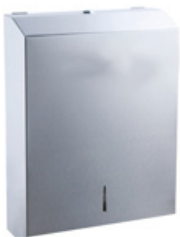
PTDSS1 Paper Towel Dispenser